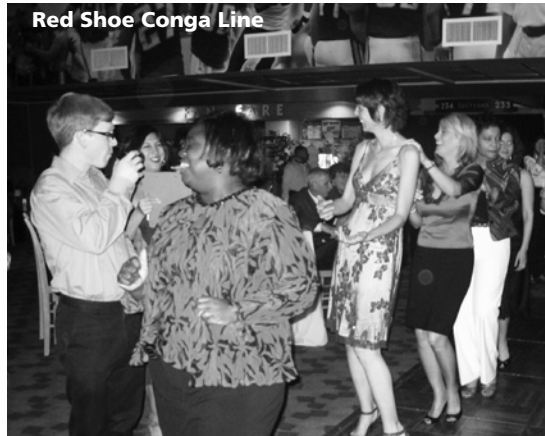
Red Shoe Conga Line