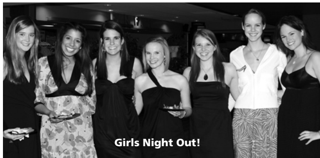
Girls Night Out!